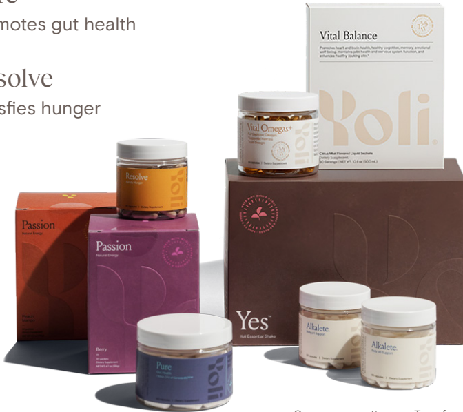
One omega option per Transformation Pack

These statements have not been evaluated by the FDA.